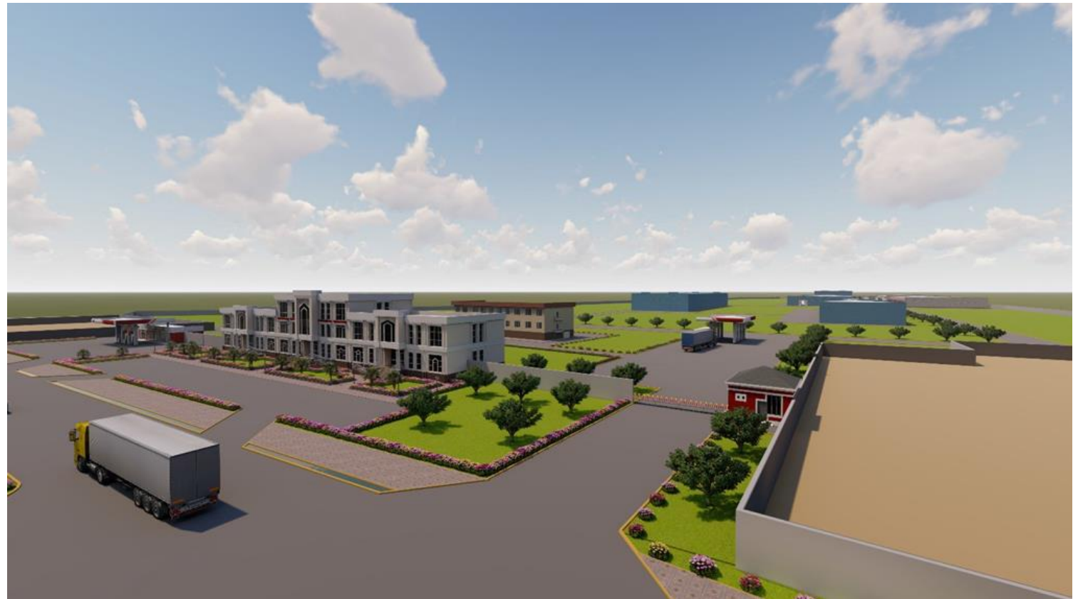
Figure 2 – General view of the logistic hub

The concept of the project stipulates the construction of the logistics hub on 23.0 hectares of the land with the involvement of government agencies to make the project more attractive. The construction of warehouse buildings, an administrative building, buildings and structures for technical and business purposes, arranging of a single window of state services for customs clearance and passing the state procedures for the control of goods quality and compliance with standards required by the law, as well as equipping an open parking lots for automobile, agricultural and special-purpose machinery.